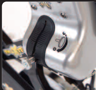
X-Bars 7-Level Resistance Adjuster