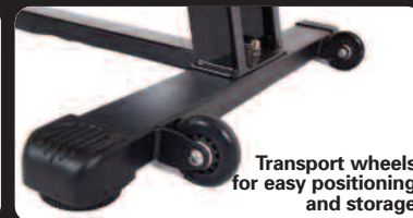
Transport wheels for easy positioning and storage