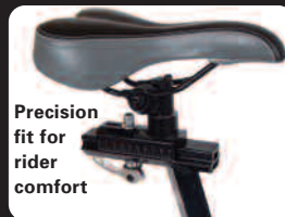
Precision fit for rider comfort